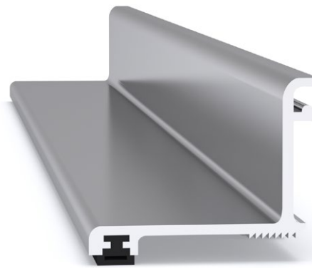
25SL - Bottom View