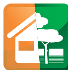
indoor & out- door use