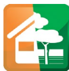
indoor & out- door use