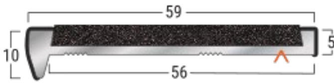
ASBRALLOY AB-FA501S (ALL BLACK 50mm ABRASIVE STRIP)