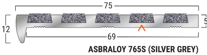
ASBRALOY 765S (SILVER GREY)