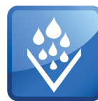
BFG water gutter