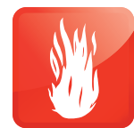
fire rated (joint widths >50mm)