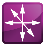
multi directional 6-way movement