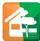
indoor & outdoor use