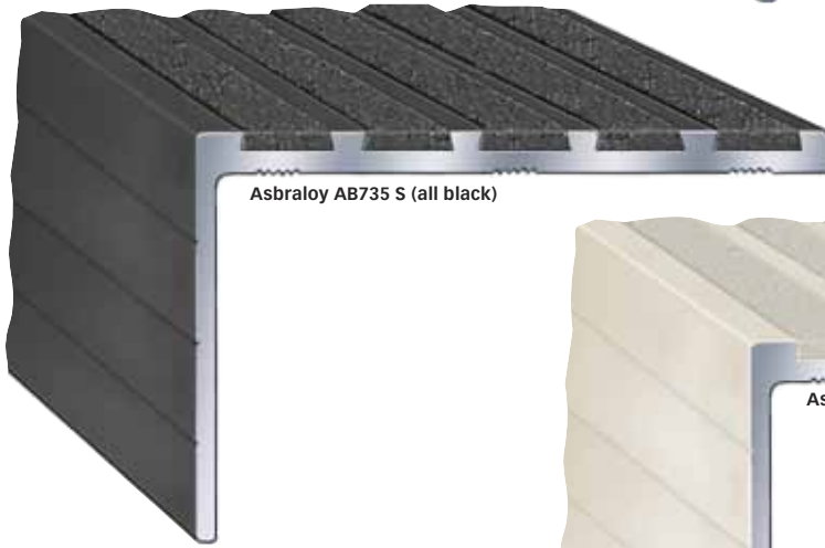
Asbraloy AB735 S (all black)

ILLUSTRATIONS SCALE FULL SIZE (approximate)