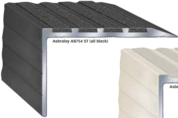
Asbraloy AB754 ST (all black)

www.latham-australia.com Email: treads@latham-australia.com