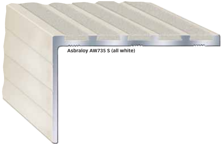
Asbraloy AW735 S (all white)