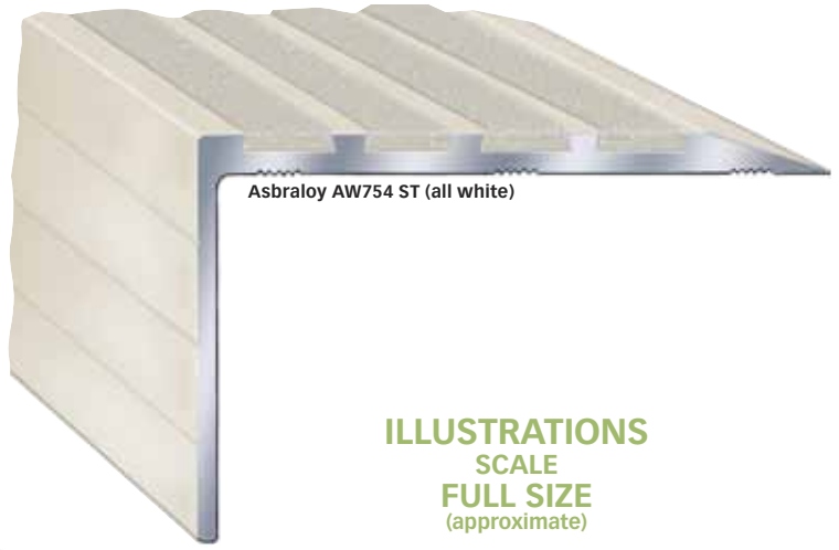
Asbraloy AW754 ST (all white)

ILLUSTRATIONS SCALE FULL SIZE (approximate)