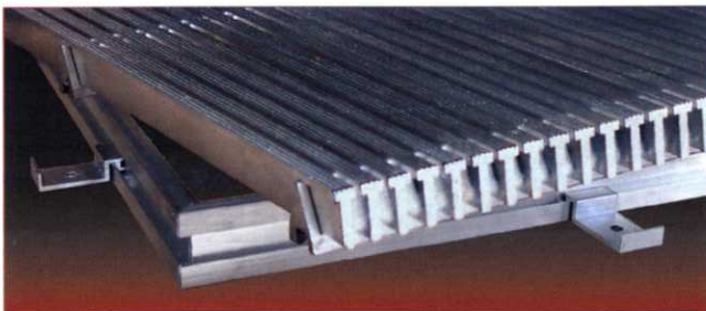
Type ALGRID Aluminium

LATHAM AUSTRALIA PTY LTD FAX: 61 2 9879 7666 PHONE: 61 2 9879 7888 EMAIL: INFO@LATHAM-AUSTRALIA.COM