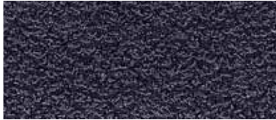
Standard Flex-Tred colour is black